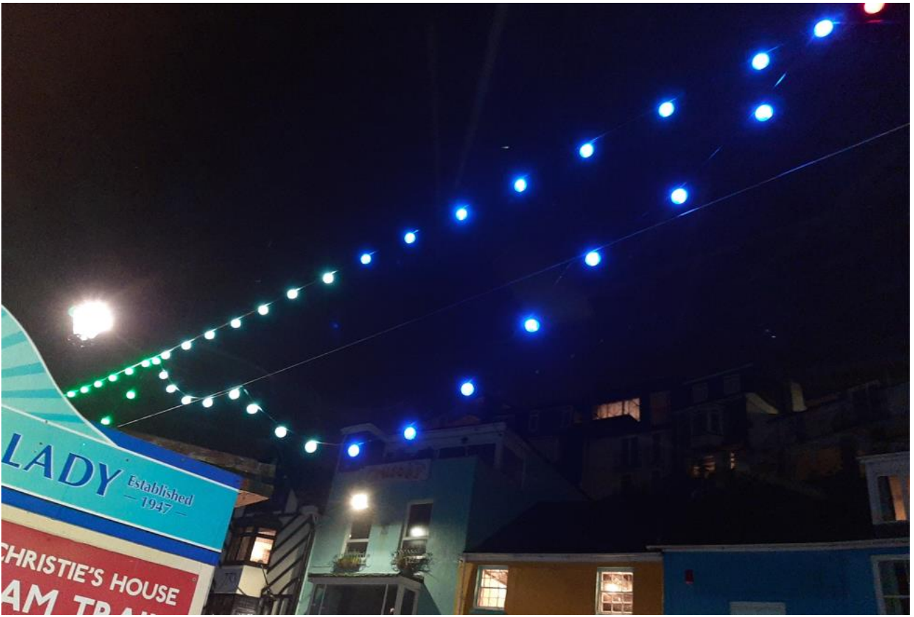
Image taken by L McGuirk, January 2021. Festoon lights along the Quay hanging quite low.