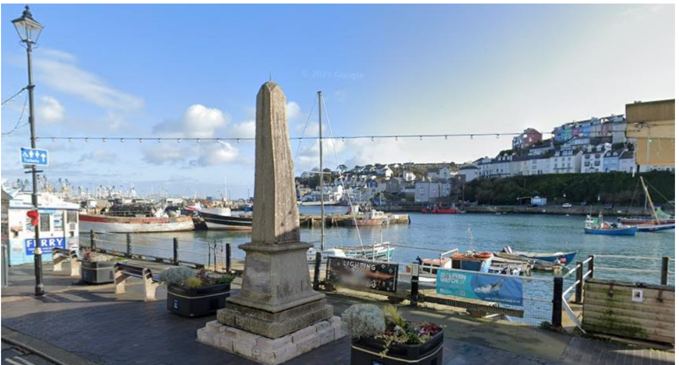
Image from Google Maps (accessed 15.07.21). Lights connecting the end of the Festoon lights to the Old Fish Market.