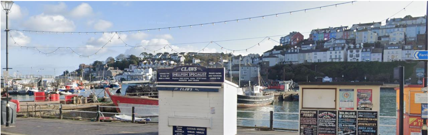
Image from Google Maps (accessed 15.07.21). Festoon Lights, first section.