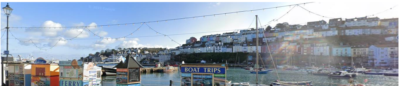
Festoon Lights, second section.