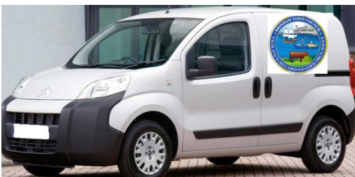
Artist's impression of Citroen Nemo Enterprise with BTC logo